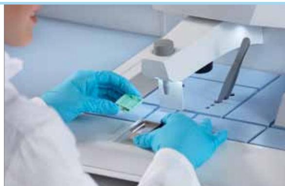
Ergonomic design – Cool and contoured

The robust HistoStar embedding workstation design minimizes moving parts, reducing wear and service requirements ensuring dependable performance for years to come.