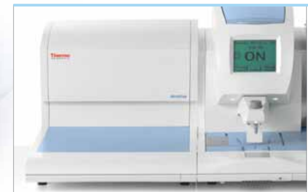
Modular cold plate – Position of optimal workflow