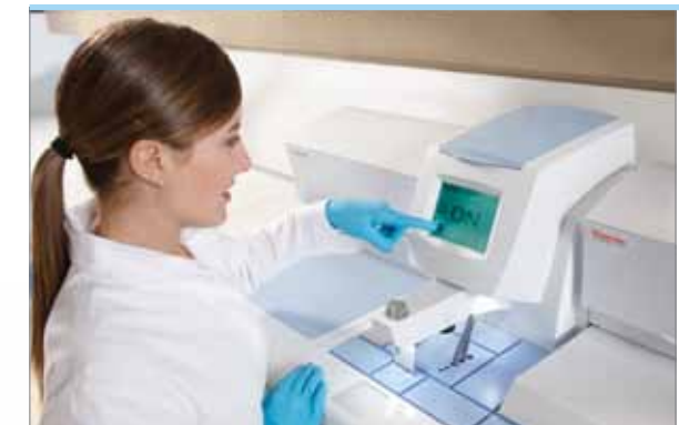
Touch screen – Simple and intuitive