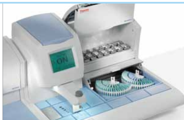
High capacity – Maximum productivity